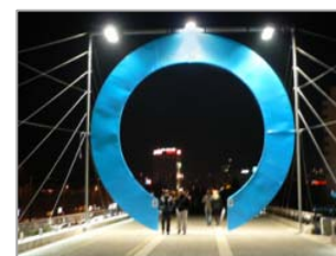
The Bridge of Love, Sofia

The country's most popular TV station was engaged as a media partner for World Diabetes Day and actively promoted the "Unite for Diabetes" charity concert, the blue lighting and all activities for the day. All the activities were made possible thanks to the support of Novo Nordisk.