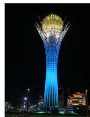
Bayterek in Blue, Astana

On 13 November, the unique 'Bayterek' landmark in Astana was lit in blue as part of the World Diabetes Day Monument Challenge.