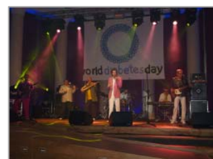
World Diabetes Day concert in Warsaw