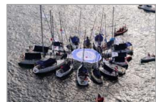
Boats on the Bosphorus gathered around a large blue circle.