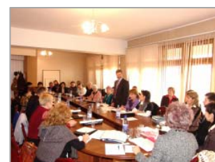
Round-table, 8-10 December

A round-table on "Ways of improving the situation of diabetes in regions of RK" was held on 8-10 December. The purpose of the event was to discuss and analyse the quality of medical care provided to people with diabetes in the different regions of Kazakhstan, and develop recommendations to improve the current situation.