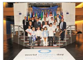
Participants at the IDF/FEND/ISPAD World Diabetes Day event in Strasbourg.