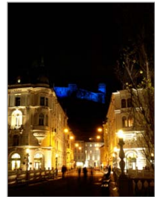
Ljubljana Castle in blue

In Slovenia , the Slovenian Diabetes Association (SLODA) marked World Diabetes Day with a variety of activities throughout the country. These included an awareness-raising event in the town of Litija, which was patroned by the President of the Republic of Slovenia, Danilo Türk, an exhibition in the largest shopping centre in Ljubljana (in collaboration with Novo Nordisk and Roche), the lighting in blue of six monuments and buildings around the country, and the 10th edition of an Amateur Radio event organised by the Association of Radio Amateurs of Slovenia.