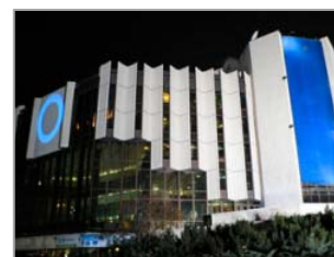
National Palace of Culture, Sofia

A 'Unite for Diabetes' charity concert dedicated to children with diabetes was held at the National Palace of Culture in Sofia. The concert was attended by more than 5000 people. A video of the event was broadcast on the country's most popular TV station on 31 December. All funds collected from ticket sales were donated to the National Association of Children with Diabetes, to support their activities aimed at improving the social integration of children with diabetes and organising summer camps. A white and blue city tram promoting the concert circulated throughout the city for over a month.