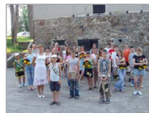
Summer camp for children with diabetes, Plateliai